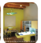
atelier art room